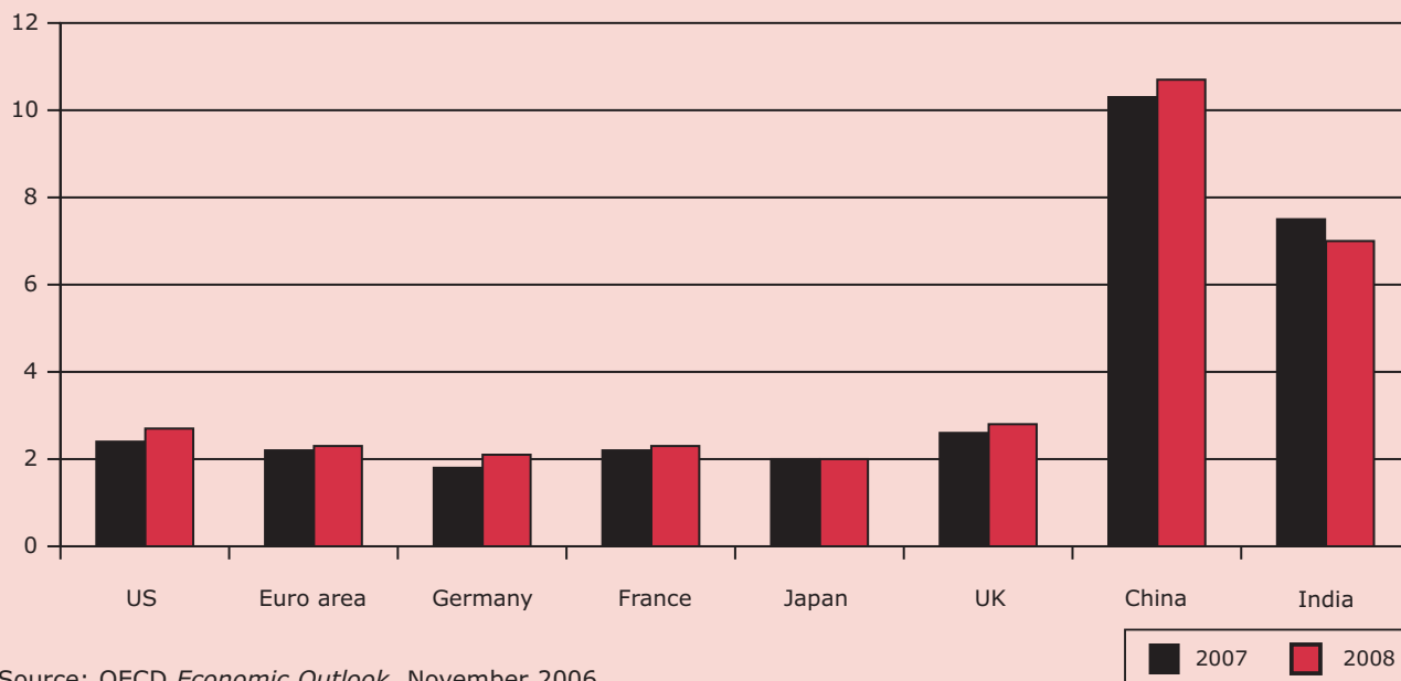
Figure 1: Output Growth Forecasts, Selected Economies, Annual % Change, 2007 and 2008.