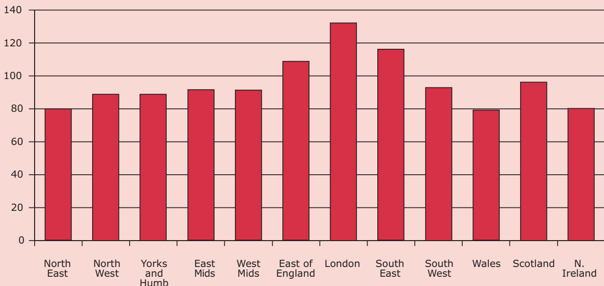
Figure 3: Regional GVA, 2004, UK=100.